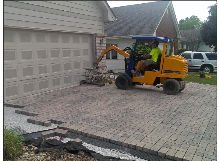
Step 4 Laying pavers