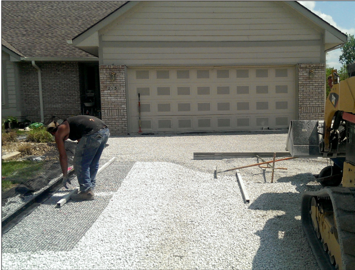
Step 3 Leveling and compacting aggregate