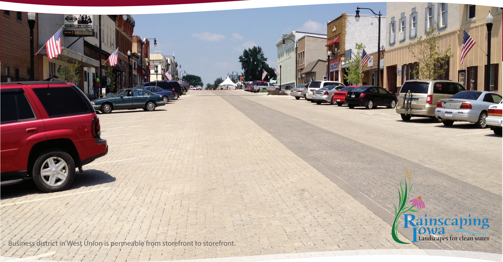
Business district in West Union is permeable from storefront to storefront.