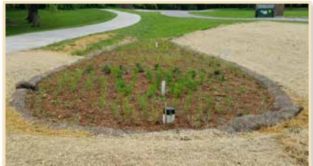
Enhanced rain garden with a vertical overflow structure.

Enhanced rain gardens are often suitable for sites in newer developments where soils are compacted and have poor drainage. Some homeowners opt for an enhanced rain garden when space is limited, or a smaller footprint is desired.