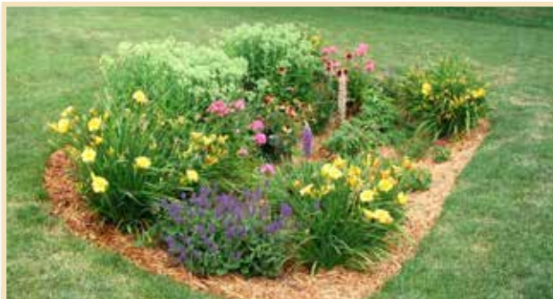
Native and non-native plants in a basic rain garden.