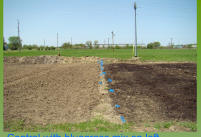
Control with bluegrass mix on left. Treatment with sub-surface ripping, surface rototilling, compost, and buffalo and blue grama grasses on right.