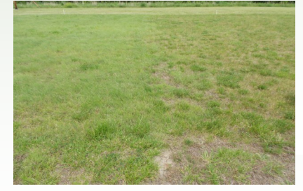
Established turf. Native grasses on treatment side on left and bluegrass mix on control side on right.

All construction sites often have excessive erosion and compaction after topsoil removal, scraping, and mass grading. Compaction results in poor growth of lawns, shrubs, and trees. Also, reduced infiltration increases runoff of nutrients and pesticides and soil erosion contributing to stormwater pollution.